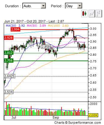
Chart INTESA SANPAOLO